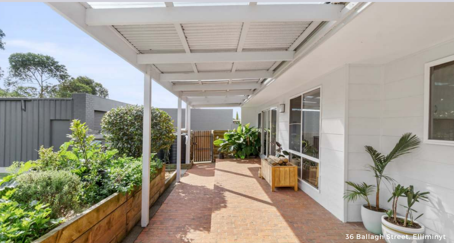
36 Ballagh Street, Elliminyt